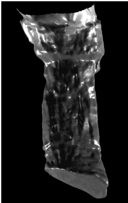
3-D models of Cenote Zacatón (above), Cenote Caracol (below left), and Cenote La Pilita, Tamaulipas.